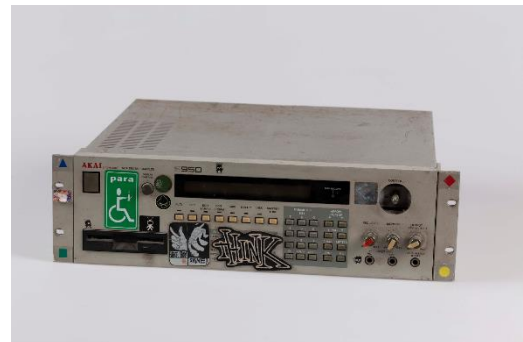
AKAI S950 Sampler used by Resin Dogs, c.1996

Australian Music Vault, Arts Centre Melbourne