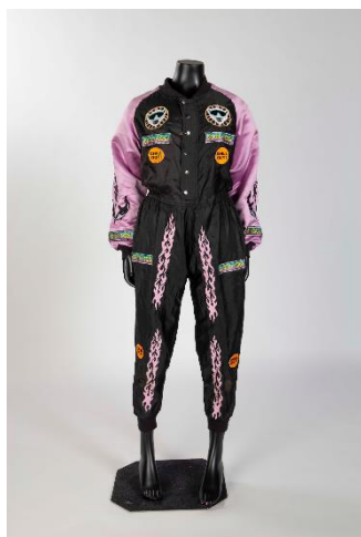
Jumpsuit worn by Tkay Maida at Splendour In The Grass, 2015

Australian Music Vault, Arts Centre Melbourne