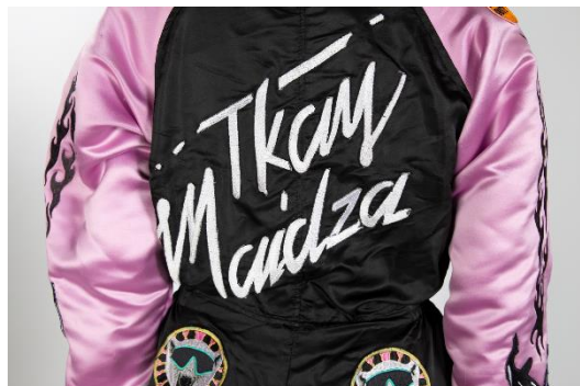
Jumpsuit worn by Tkay Maida at Splendour In The Grass, 2015

Australian Music Vault, Arts Centre Melbourne