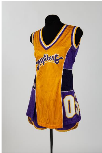
Outfit worn by Maya Jupiter in 'Move' video, c.2003