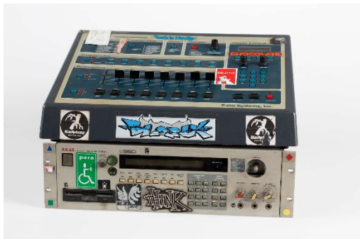
E-mu SP-12 drum machine & AKAI S950 Sampler used by Resin Dogs, c.1996