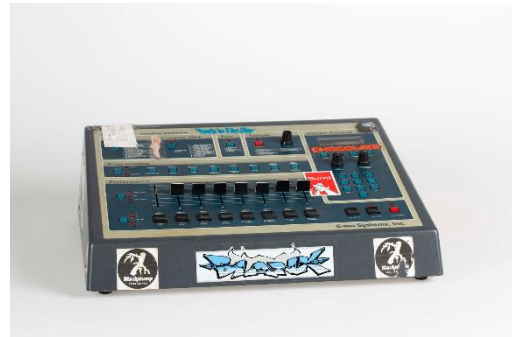
E-mu SP-12 drum machine used by Resin Dogs, c.1996

Australian Music Vault, Arts Centre Melbourne