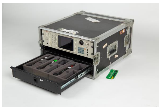
Rack mount containing digital sampler and three cordless microphones used by Downsyde, c.2000

Australian Music Vault, Arts Centre Melbourne