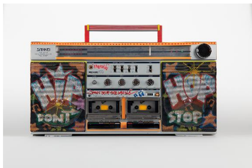
Sankei stereo double cassette boom box used by DJ Peril, c.1984