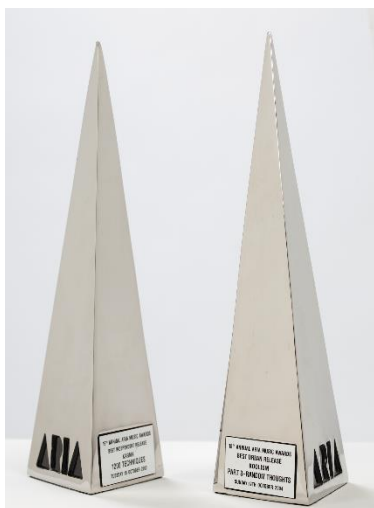
ARIA award for Best Independent Release presented to 1200 Techniques for 'Karma', 15 October 2002

Australian Music Vault, Arts Centre Melbourne