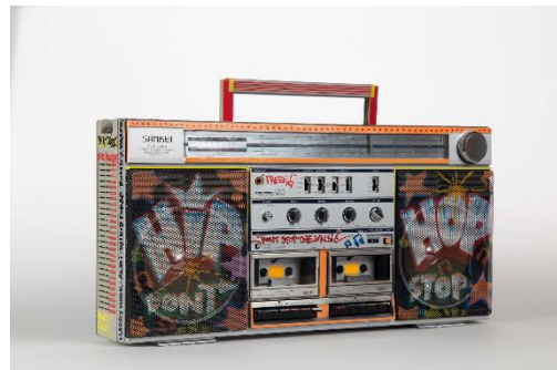
Sankei stereo double cassette boom box used by DJ Peril, c.1984

Australian Music Vault, Arts Centre Melbourne