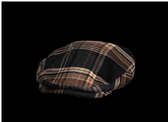
Kangol Heritage tweed flat cap worn by Mantra, c.2010

Australian Music Vault, Arts Centre Melbourne