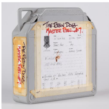
2-inch tape for 'Grand Theft Audio' by Resin Dogs, 2000

Australian Music Vault, Arts Centre Melbourne